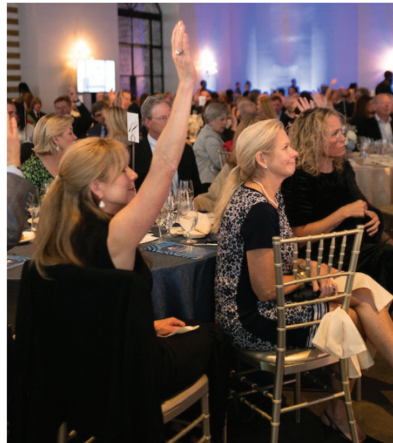
2023 Annual Dinner at The Revaire